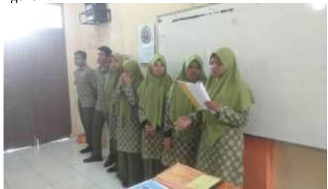
Figure 2. Student activities during learning using ethnoscience-based worksheets.

The process of implementing the worksheets that have been designed, after passing the assessment process and 2 trials. The implementation of these worksheets was carried out at Senior High School 2 Unggul Ali Hasjmy to know the increase in students' creativity towards learning using ethnoscience-based worksheets. The activities of students can be seen in Figure 2.