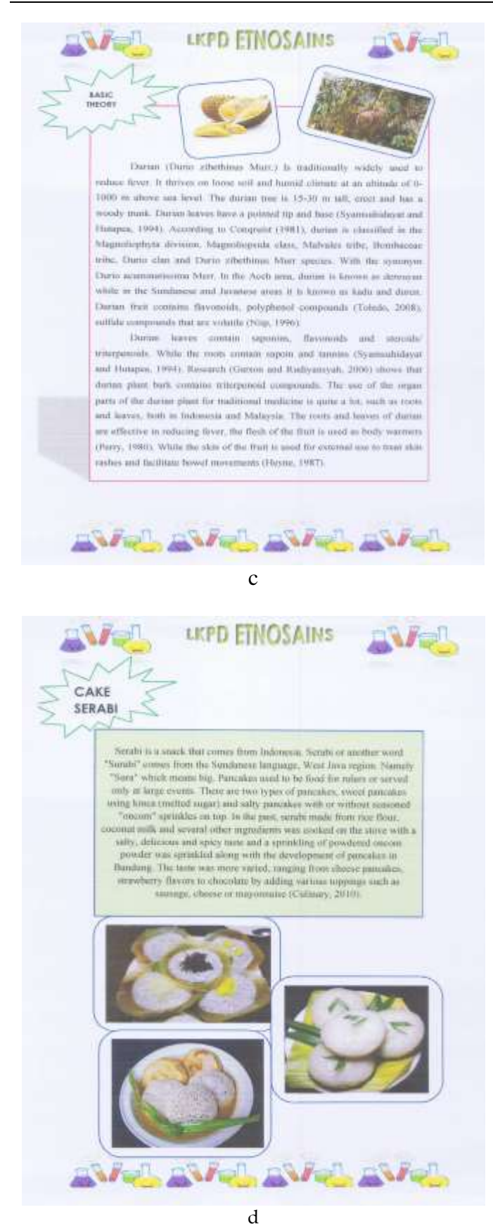
Figure 1. Description of the initial design of ethnosciencebased worksheets; (a) cover, (b) KI, KD, GPA, and learning objectives, (c) theoretical basis, (d) understanding.