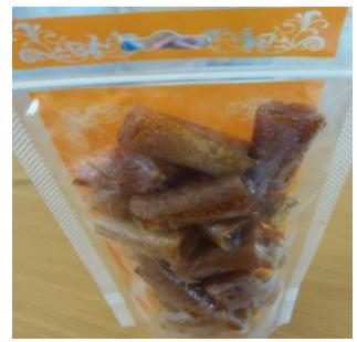
(5) (6) Figure 2 The results of student creativity in craft and entrepreneurship learning using STS-based student worksheets: (a) group 1, (b) group 2, (c) group 3, (d) group 4, (e) group 5, and (f) group 6.