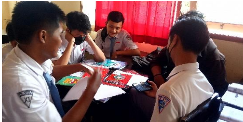
Figure 2. Simple practice

with water is vibrated by beating the table and then students measure the direction of the table's propagation of the vibration of the water. Motive is a potential energy for the occurrence of behavior or action. Students have a motive that aims to be able to motivate themselves in understanding the physics concepts being studied (Suharni & Purwanti, 2018).