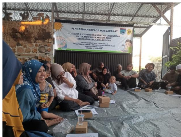
Figure 3. Implementation of socialization of waste processing into ecoenzyme soap in Gegutu Reban Hamlet, Dasan Griya Village, West Lombok

The socialization activities involved various elements of society in Gegutu Reban consisting of housewives, the SABRO (Sapu Bersih Dedoro) youth group and community leaders of Dasan Griya Village, totaling 30 people. The results of monitoring during the activity showed that the majority of participants were very enthusiastic about participating in the activity, starting from face-to-face sessions, demonstrations, practice to focus group discussion sessions (Figure 3).