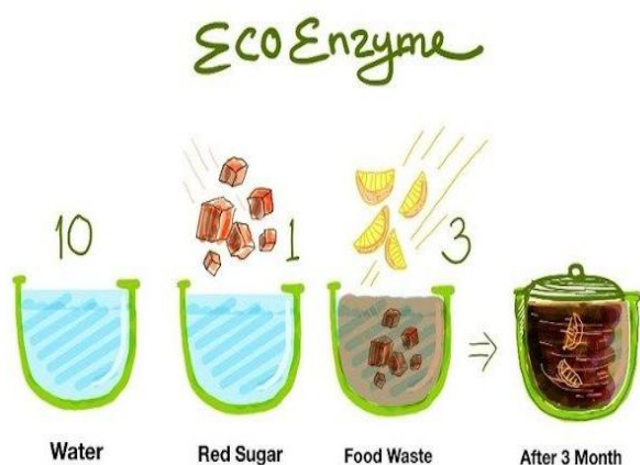
Figure 4. Workflow for processing kitchen waste into ecoenzyme liquid soap

Processing household organic waste, especially kitchen waste into fermentative products, namely ecoenzyme liquid soap, can be done easily (feasible) by housewives and young women. Ecoenzymes can be made from 1) brown sugar/molasses, 2) organic kitchen waste, and 3) pure water from a source or rainwater in a ratio of 1:3:10, then stored in anaerobic or airtight conditions or tightly closed for 3 months (Figure 4).