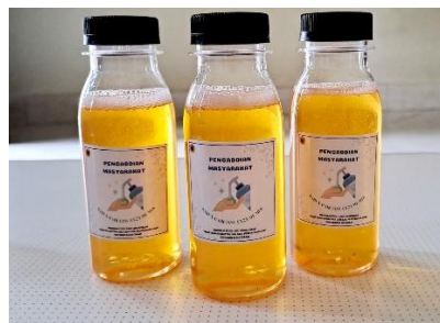
Figure 4. Example of ecoenzyme liquid soap packaging made from kitchen waste

At harvest, the product is filtered and then packaged in clean containers or bottles. This ecoenzyme liquid soap can be used to meet daily household soap needs or can be bottled for sale (Darunnafis et al. , 2025). An example of ecoenzyme liquid soap packaged in bottles can be seen in Figure 5.