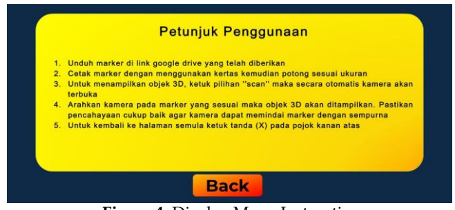
Figure 4. Display Menu Instructions

In addition to the design of the AR media, instructions for use are also included in the aspects considered difficult, where this aspect is in the logit between 0 and 1 log. This is reinforced by the results of suggestions from respondents who said that the instructions for using the media were still too general and unclear.