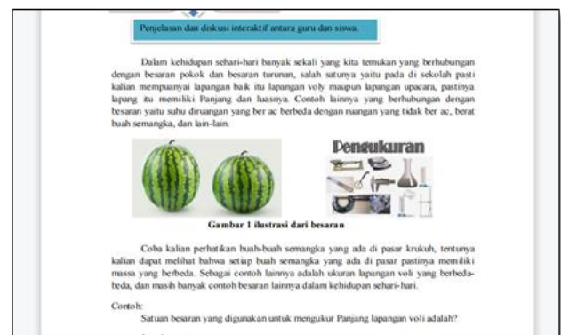
Figure 3. Physics worksheet

The closing stage required student to make a summary of what they had done in previous stages of the learning model. The diction used in worksheet has been adjusted to meet students' level of competency so as to make them understand the concept easily. The worksheets were also equipped with the interesting pictures, assisting students in understanding the presented concept of materials.