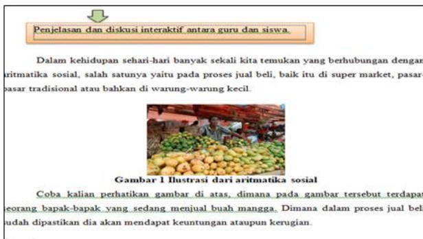
Figure 1. Mathematic Worksheet

In the introduction section, students were asked to recall previous learning materials related to which that were going to discuss. The items of questions used in the worksheet were designed to convey the students' local wisdom.