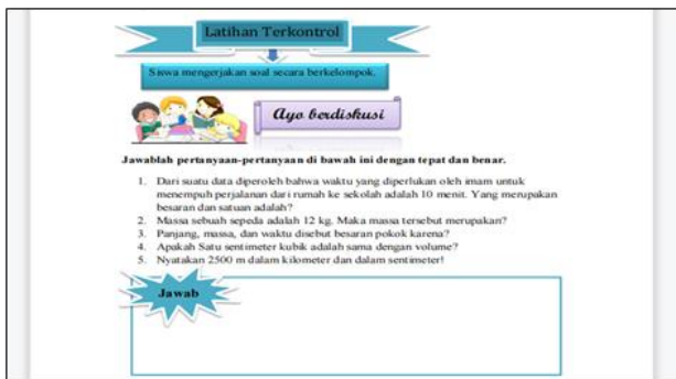
Figure 4. The dissemination of physics students' Worksheet

As it can be seen from figure 4, students' worksheet in teaching and learning physics is written in accordance with the value of students' local wisdom. The teaching material as such, in terms of exercise, was designed to make students' accustomed with the concept of physics found in their daily life. The controlled-exercise can be done independently or in a group work.