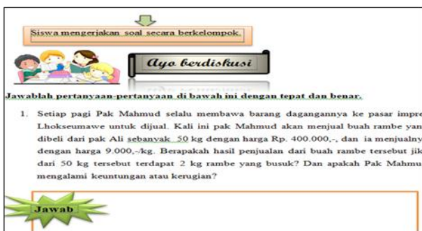
Figure 2. Exercise based local wisdom value

The above figure illustrates that the worksheet was developed in accordance with students' daily life. The picture was then used to narrate students the social arithmetic concept, the profit and loss faced by the seller. The use of teaching material based students' local cultural conduct is important instead of orientating the teaching and learning solely on cultureless mathematical concepts (Belbase et al., 2021).