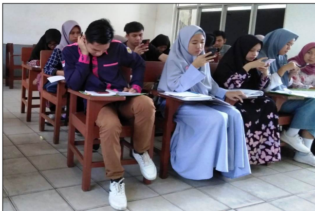
Figure 1. Students are carrying out conventional learning assisted by learning media

Implementation of learning according to schedule. Technical implementation of learning is explained before the implementation of research. At the end of course, a test was conducted to find out student’s understanding of concept and problem-solving skill. Participants who took the test as shown Figure 1.