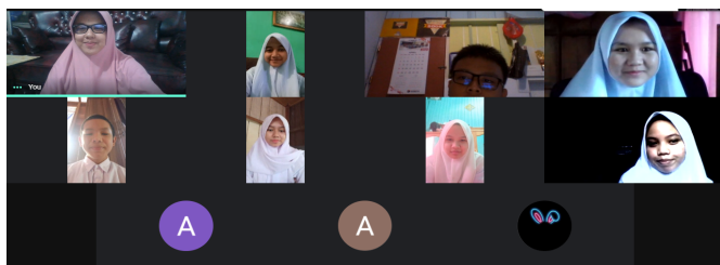
Figure 3. student activities

This research integrates socio-scientific issues through group investigation, discussion, debate, and mutual evaluation. Students' focus on teachers is minimized through the SSI approach with the GI model, and students are more responsible for dealing with problems. Teachers have an essential role in presenting more varied learning to trigger the growth of students' critical thinking skills. With group activities to investigate a problem, students can construct or build their knowledge, experience the pain, find solutions, exchange information with fellow students in their group, and not just memorize material from the teacher. In addition, using the SSI approach can stimulate students to use their logical abilities to solve problems related to everyday life (Sismawarni, 2020).