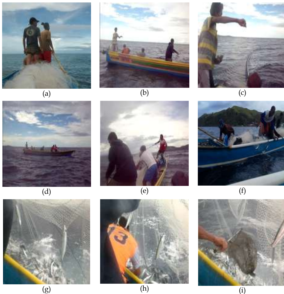
Figure 3. Activities of senior fish fishermen in the fishing area Caption: (a) Fishermen monitor schools of fish; (b-c) fishermen throw stones towards the shoal of fish; (d-f) fishermen pulling the net onto the boat fiber; (g) fish caught in net bags; (h. Fishermen releasing fish caught in the net; i. fishermen fish from inside the net bag using a scoop.

of julung-julung fish. Fishermen recognize that when seawater becomes highly turbid and brownish in color – typically due to sediment carried by runoff from rivers after rainfall – schools of julung-julung fish tend not to appear. Under such conditions, fishermen usually refrain from going out to fish. In addition, natural indicators such as the loud calls of fish-eating birds at night are interpreted as signs of the presence of fish schools, often associated with abundant catches.