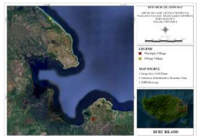
Figure 1. Map of sample collection sites on Buru Island

This study was carried out in Ubung and Waelapia Villages, Buru Regency, Maluku (Figure 1) between February and April 2022. Data were collected through direct field observations and interviews. Observations focused on documenting fishing activities, how fishermen organized themselves, and the roles of each group member. The study involved all active julung-julung fishermen in both villages, totaling 46 individuals. These participants were identified through information provided by the local community and confirmed with village leaders to ensure that they were actively engaged in julung-julung fishing. Interviews were conducted face-to-face using a flexible approach, allowing respondents to share their experiences while still covering key topics such as fishery characteristics, fishermen's profiles, group structure, division of tasks, as well as local knowledge and fishing practices.