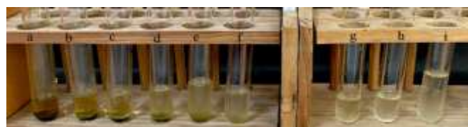
Figure 2. Turbidity (MIC) (a) P 100%; (b) P 50%; (c) P 25%; (d) P 12.50%; (e) P 6.25%; (f) P 3.13%; (g) P 1.56%; (h) P 0.78%; (i) P 0.39%

MIC testing is done by observing the test tube of each concentration treatment marked turbid and whether or not the tube. Clear tubes indicate that the treatment concentration is the Minimum Inhibitory Concentration (MIC). The results of MIC testing of ethyl acetate extract of jamblang leaves showed that the treatments 12.50%, 6.25%, 3.13%, P 1.56%, 0.78% and 0.39 still looked cloudy, while 100%, 50% and 25% were clear. The lowest concentration that is not covered by bacteria (clear) is determined as the MIC value, so the MIC value is found at a concentration of 25% (Figure 2).