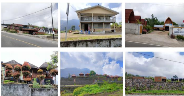
Figure 2. Lodging along the main road of Sajang Village.

Based on interviews that have been conducted with 100 tourists, the perception and expectations of tourists in the development of agrotourism in Sajang Village were obtained. The hope includes improving existing facilities in Sajang Village such as infrastructure and accessibility to the village.