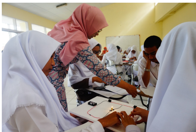
Figure 3. Teacher Activities

make estimates and interpretations based on appropriate proportions.