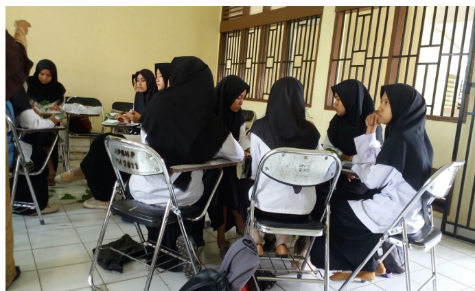
Figure 2. Student Activities

obtained, how to conclude from the available premises, and conclusions based on specific inference rules—a broader form of activity than the ability to think logically in solving problems sensibly. According to Sumarno, et al., (2012) and Fardiana, et al., (2019), the ability to think logically includes the ability to: (1) draw conclusions or make estimates and interpretations based on appropriate proportions, (2) draw conclusions or make estimates and predictions based on opportunities, (3) Draw conclusions or make estimates or predictions based on a correlation between two variables, (4) Determine the combination of several variables, (5) Analogy to draw conclusions based on the similarity of the two processes, (6) Doing evidence, (7) Prepare analysis and synthesis of several cases. Seven indicators can be simplified into (Hidayat & Sumarmo, 2013; Bakhy et al., 2018): (a) conclude analogies, generalizations, and constructing conjectures, (b) draw logical conclusions based on the rules of inference, checking the validity of arguments, and compiling valid arguments, (c) compiling direct or indirect evidence.