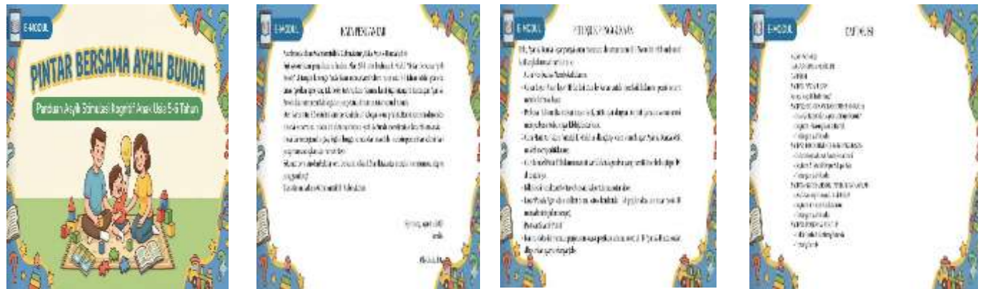
Figure 2. Opening display

strengthen individuals' belief in their capabilities (Bandura, 1997). When parents are equipped with structured guidance and practical examples, their self-efficacy in supporting children's learning increases, leading to more effective parent-child interactions.