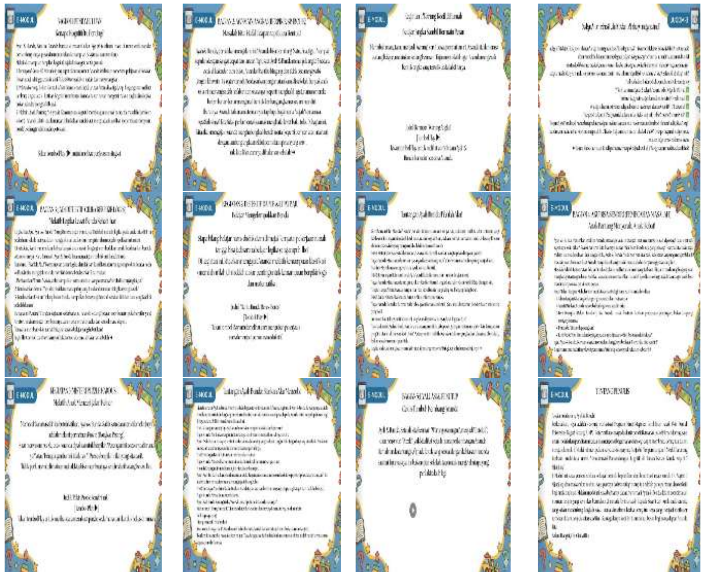
Figure 3. Audiovisual-based parenting e-module content stimulates children's cognitive abilities