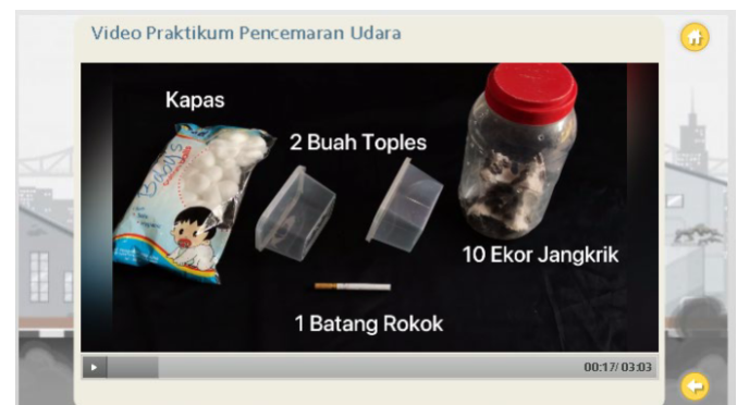
Figure 4. Practicum video in articulate storyline media

Articulate storyline also raises students learning motivation, it is also supported by students' opinions that; "i am motivated to learn when using the media because the content of the material is easy to understand" and the students stated that; "the media also motivates me to learn because all the material presented what is in the media is very easy to understand so that it adds to my understanding in the teaching and learning process, and this media also does not give a sense of boredom" . In general, the use of storylines that articulate makes students feel happy because learning is packaged using technology but still cannot be separated from learning objectives so that students feel motivated (Pratama, 2018; Indriani et al., 2021).