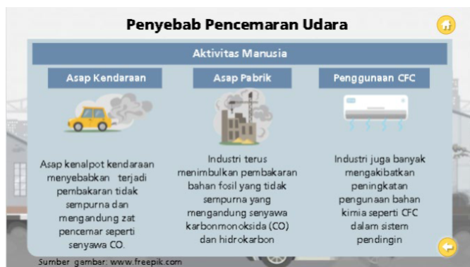
Figure 3. Image display on One Page in Learning Media

The validity of the articulate Storyline is obtained from the media quality assessment of the validators. Articulate storyline validated by experts. There are six aspects of the assessment with a total of 34 assessment items. The data from the validation results by 4 validators on the articulate storyline can be seen in Table 1.