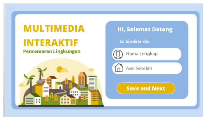
Figure 2. The initial appearance of the media articulate storyline

Researchers developed an articulate storyline for junior high school students on environmental pollution. The interactive multimedia articulate storyline that has been created by this researcher has advantages. In use, it can be accessed online or offline. Articulate storyline has more complete features compared to power point so it is more interesting.