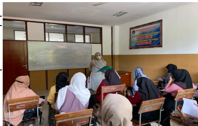
Figure 2. Filling a motivational questionnaire by students at the University of PGRI West Sumatera

strategy and design course, in which the questionnaire was distributed to students who are taking biology learning strategy and design courses. at STKIP Ahlussunnah Bukittinggi and PGRI University West Sumatra with a total of 32 students. The student motivation questionnaire consists of 14 statements. Overall, the average student learning motivation is 96.37% with very high criteria. For the percentage of each statement can be seen in Table 2.