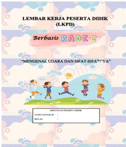
Figure 1. Cover of Student Worksheet

including instructions for use, indicators, and learning objectives. Figure 3 contains student worksheet content. An overview of student activities in at each stage of RADEC can be seen in Table 2.