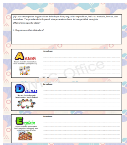
Figure 3. Content of Student Worksheet