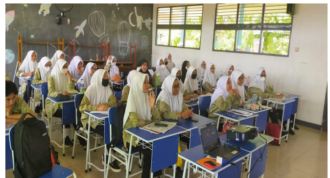
Figure 1. Learning Process

From the results of research carried out with learning carried out using rattlesnake learning media (optical snake ladder), learning tools in the form of lesson plans obtained validation with an average of 3.27 with a very feasible category. Furthermore, the instrument is obtained that the instrument used is feasible with a percentage of 80%. The results of the RPP validation can be seen in Table 4.