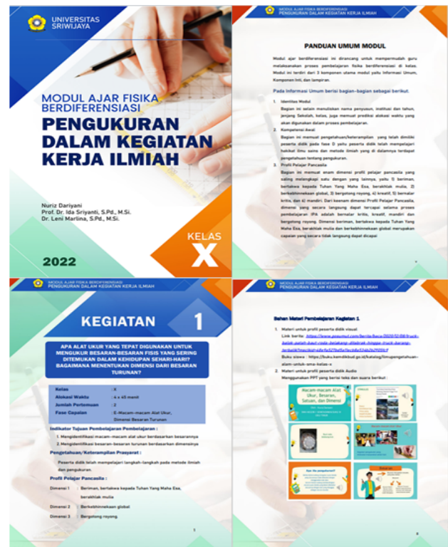
Figure 2. Prototype 1 display

At the stage of developing teaching modules differentiating measurement materials in scientific work activities, researchers make prototypes according to the design at the design stage. The prototype one display is shown in Figure 2.