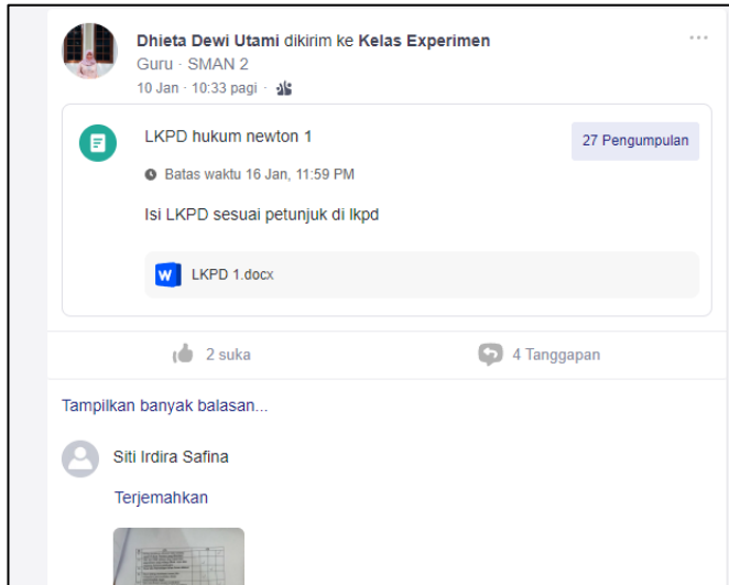
Figure 1. Display of activities on the Edmodo platform

This research looks at how the motivation and independence of student learning using Edmodo is assisted by a virtual laboratory. The virtual laboratory used in this research is PhET Simulation. The results of learning physics using Edmodo assisted by a virtual laboratory can be seen in Figure 1 where students carry out learning activities by working on student worksheets (LKPD) that have been inputted into the class contained in the Edmodo application.