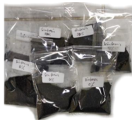
Figure 3. Fe 3 O 4 powder from Cemara Beach.