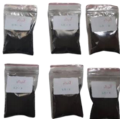
Figure 2. Fe 3 O 4 Powder from Ijobalit Beach.

Data in table 1 shows that from 50.00 grams of natural iron sand Ijobalit beach and Telindung Beach contain magnetic minerals of 46.78 grams or 93.56 % and 43.50 grams or 87.00 % respectively. Meanwhile, on Cemara Beach a natural iron sand sample of 274.62 grams obtained magnetic minerals of 200.46 grams or 72.99 %. The percentage of the data indicates the number of magnetic minerals on natural sand on the beach located on the island of Lombok. The high percentage produced indicates that in natural sand there is a magnetic mineral characterized by black sand and attached to a permanent magnet when defeated (Susilawati et al, 2022). This shows that the more magnetic minerals from natural sand attached to a permanent magnet, the more magnetic minerals are contained (Hambali et al, 2021).