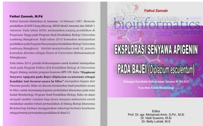
Figure 1. Cover design before revision

Efforts that can be made to preserve local wisdom, one of which is to use it as a learning resource. Integration of local wisdom values in lecture activities can build a suitabilities between the cultivated attitudes and knowledge for the values growth in society (Hartini et al., 2018).