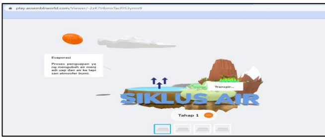
Figure 4. 3D Animation Display

The interactive module developed is also equipped with practice questions which can be accessed via the quizziz page as shown in Figure 5.