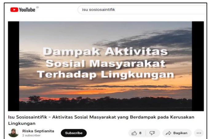
Figure 2. Videos On Socioscientific Issues

The interactive module is equipped with a links which is used to display learning video. Videos on socioscientific issues containing the impact of the expansion of the Semarang city area into the Gunungpati sub-district on the environment which is displayed via YouTube as shown in Figure 2.