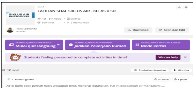
Figure 5. Practice Questions Display

The interactive module developed is also equipped with practice questions which can be accessed via the quizziz page as shown in Figure 5.