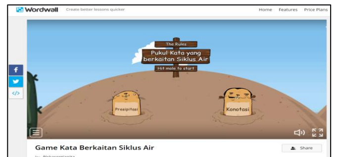
Figure 3. Digital Game Display

Digital games are arranged using water cycle materials and created using the wordwall application as shown in Figure 3. There are two types of digital games, namely hitting terms related to the stages of the water cycle and searching for the correct answers to the questions displayed regarding the water cycle material.