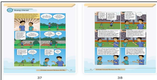
Figure 6. Comic Display

The content section of the interactive module is also equipped with a literacy page which is designed in comic form as shown in Figure 6, so that students are interested in reading the information presented so that it makes the module look more attractive and becomes a differentiator from teaching materials in general.