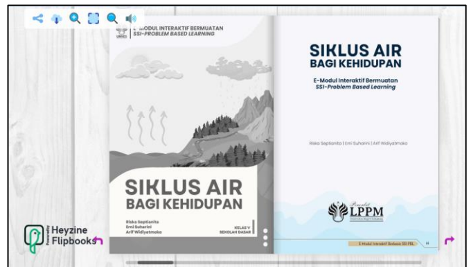
Figure 7. Digital Display of Modules

Interactive modules are displayed digitally using third-party applications, namely heyzine flipbooks as shown in Figure 7. So that apart from being able to print modules, teachers can also use a laptop connected to the internet network to display modules via a projector screen so that they can be directly connected to video, game or animation pages. The development of touch screen-based mobile devices has added to the interactive moving images presented in digital books (Budiaman et al., 2021).