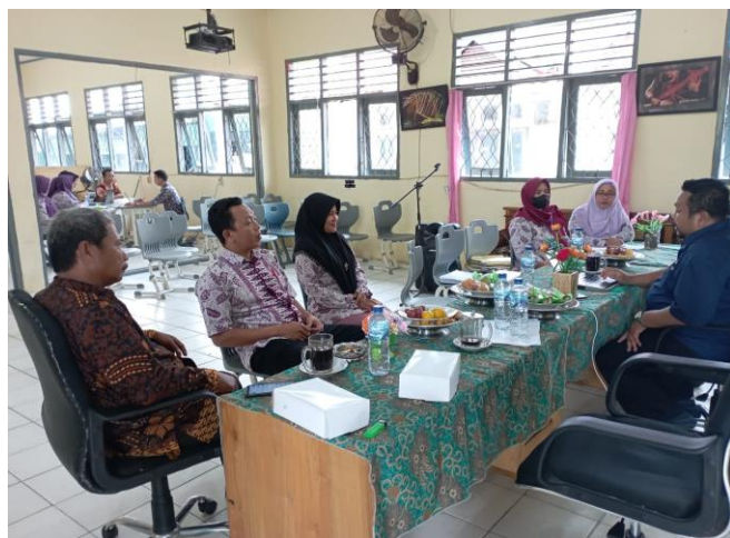
Figure 2. Interview Activity

Interviews were carried out using a purposive technique with 7 informants who were conducted directly at SDN 008 Samarinda Ulu, at the house concerned or through a device. The interviewees were given the initials, namely KSM, YN, MAZ, DPA, SAB, NAM, R. The following is the documentation of the interview activities at SDN 008 Samarinda Ulu.