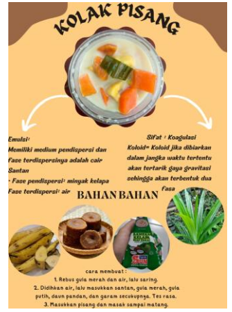
Figure 4. Student Project Results

components that are assessed including: concept correctness, completeness of ideas, grammar and creativity. One of the student project results can be seen in Figure 4.