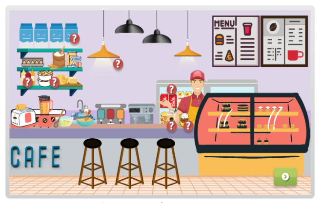
Figure 2. Cafe Quiz View

Quiz illustrations are designed to be as attractive as possible, which allows students to be enthusiastic about working on quizzes, taking into account the appropriate color choices. This is in accordance with Tumewan et al. (2021), that choosing the right color can set a mood and make text on media more attractive. Interesting visuals can increase enthusiasm for learning (McCrudden and Rapp, 2017). In this quiz students are asked to look for colloidal items in the illustration. After students find colloidal items, students are asked to answer questions related to colloidal items in the cafe and garden illustrations. Each quiz has 3 questions to answer. The form of the question is essay.