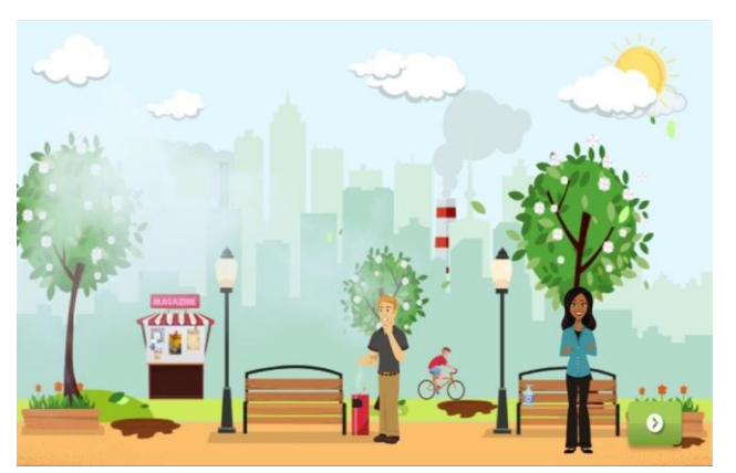
Figure 3. Garden Quiz View