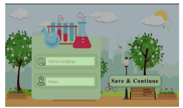
Figure 1. The Initial Appearance of the Media Articulate Storyline

This study uses articulate storyline 3-based learning cars with the application of the Project Based Learning (PJBL) model to measure student learning activities carried out in 3 meetings. The first meeting, providing an overview of material related to project assignments carried out online. The second meeting, independent assignment using student worksheets and quizzes as well as project monitoring. The third meeting, project presentations and filling out student activity questionnaires. The initial page of learning media using articulate storyline 3 can be seen in Figure 1. This media consists of core competency & basic competencies instructions for use, colloidal material, quizz, and examples of poster assignments, and references as shown in Figure 1.