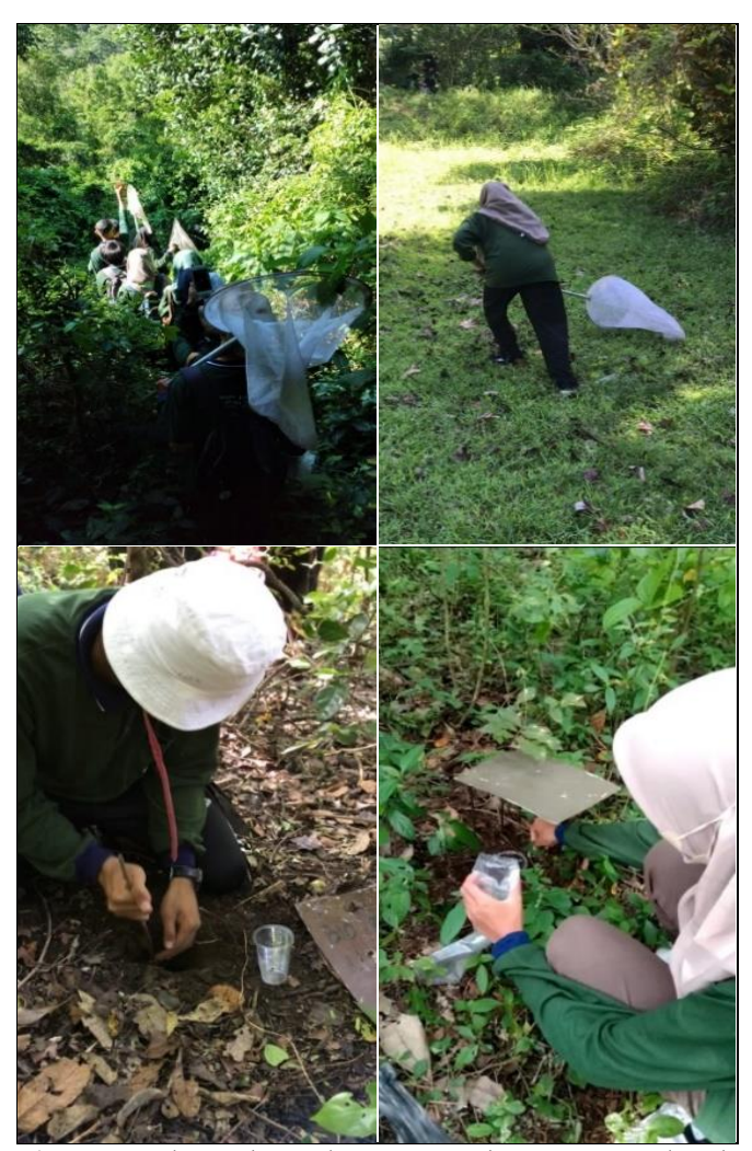
Figure 2. Arthropod sampling in Kerandangan National Park using nets (top) and pitfall traps (bottom)

Once the arthropods were collected, students proceeded to bring them to the laboratory where they would identify them at the order and family level. The lecturers provided assistance to students during this process of arthropod identification. The students' laboratory activities are illustrated in Figure 2.