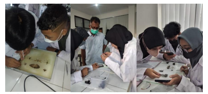
Figure 3. Open inquiry practicum activities in the biology laboratory

To evaluate the initial abilities of the students, a pretest was administered before the Invertebrate Zoology practicum was conducted. The pretest consisted of a science process skills test in the form of an essay question and was given to both the control and experimental groups. After completing the practicum, a post-test was conducted to assess the students' learning outcomes. The practicum topic focused on the collection and identification of arthropod animal groups, which was carried out by both the control and experimental classes. The control class was given practicum instructions, while the experimental class designed experiments based on literature searches and discussions with the practicum lecturer. Table 1 presents the results of the post-test, which assessed the science process skills of both the control and experimental groups.