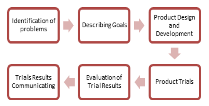
Figure 1. Steps of D&D model

This study adopts the design and development (D&D) model developed by Richey dan Klein (2007). The D&D model includes the process of design, development and evaluation. The purpose of this research is to design learning media based on Android QuickAppNinja (guess image & find words game) to increase elementary school teachers' digital literacy. Development stages in research with the D&D model according to Peffers et al. (2007) includes: