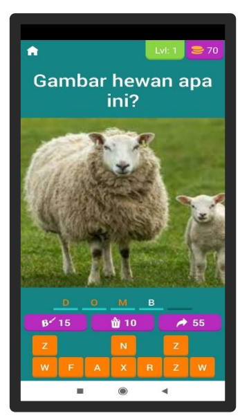
Figure 4. Application for guessing animal images

Select the guess image game, then set the appearance of the game by selecting a design which includes themes, gameplay, completed, hints, get coins, buy coins, menus, and rate us. Before being distributed to clients, the steps that must be taken for testing of program units. These program units are tested as a complete product to determine whether the system can function properly or not.