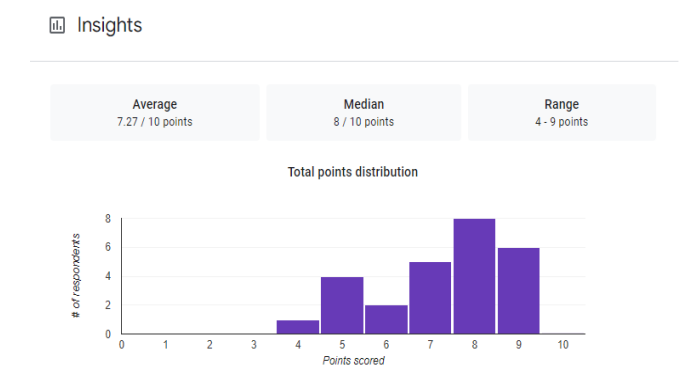
Figure 5. Average test results in the evaluation process

Evaluation is a process of ensuring that the product being developed has been properly designed, with the goal of efforts to improve the digital skills of elementary school teachers. In other words, evaluation is the process