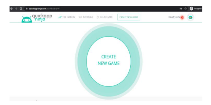
Figure 3. Create new game

The next step is creating the interface. At this stage, the author practices using the QuickAppNinja application as a tool for creating android applications without coding. First, the user must register via email in order to access the application. after success, you can then create a new game by selecting the "Create New Game" button as shown in Figure 3, include QuickAppNinja has four choices of game templates consisting of guess the picture, tile, 4 pics 1 word, and find words templates, guess the picture is a game that contains guessing pictures accompanied by word clues, tile is a guessing game whose contents are shaded or partially covered, 4 pics 1 Word is a game to guess words from 4 pictures presented in 1 game box, this game is very popular because it sharpens the brain of its users, and find word is a word search game from a collection of available words. The last step is integrating. After going through the system design stage, the next step is the realization of the application design as a program unit (Figure 4). Here is one view of the application being developed.