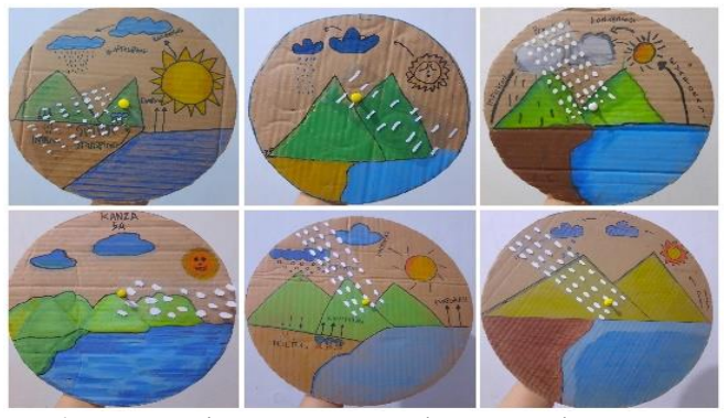
Figure 5. Student creativity results in enough category

Students who experienced an increase in creativity in the fairly visible category from student numbers (2, 3, 5, 6, 7, 8, 9, 11, 12, 13, 14, 15, 16, 17, 19, and 21). In this category, students are able to sequence the water cycle process correctly. However, some students do not understand the meaning of evaporation, condensation, precipitation, and infiltration. So that some of the pictures made by students are not correct in making cycle arrows, and the stages of the water cycle have not been included, as shown in Figure 5. Some students in the category still tend to be passive and shy to express their opinions, so the teacher motivates students to be brave in answering and active in discussions.