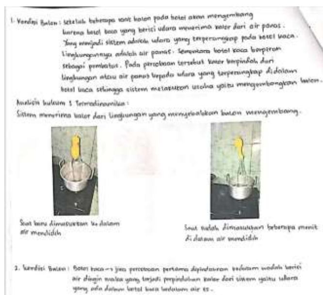
Figure 3. Example of student worksheet learner answers

By incorporating each level of the guided inquiry learning model with the station-rotation paradigm in blended learning, learning may be made more significant, important, and dense. LMS-based blended learning is improving students' higher order thinking abilities on thermodynamics material in class XI MIPA 2