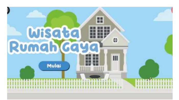
Figure 1. Front view of Wismaya

The product developed is in the form of Androidbased science learning media with the help of the Adobe Falsh CS6 app. Media development is used to analyze the critical thinking skills of fourth grade elementary school students in the material of style and its application in everyday life as well as the relationship between force and motion. Android-based media development is packaged in an extension (apk) in the form of an educational game called Wismaya (Tourism Rumah Gaya). Wismaya has the concept of a house that has several information rooms, to be able to proceed to the next room, students must answer questions related to the Republic of Indonesia to foster a sense of nationalism in students. The components in the Wismaya learning media are as follows: The initial display is a cover with a start button to enter the menu.