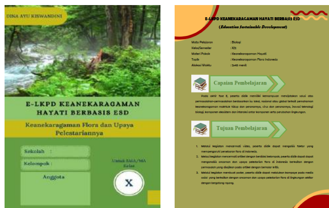
Figure 1. Design E-LKPD based ESD

The content presented in the ESD-based biodiversity E-whorksheets is as follows: The title page contains the identity of the student and the title of the E-LKPD , Topic and time allocation, Learning outcomes of Phase E, Learning objectives , Instructions for using biodiversity e-whorksheets Problem orientation, Critical thinking zone, Creative zone , Environmental exploration, Student creativity zone, Science literacy zone, Kepo Room, Reflection on learning. As for some of the biodiversity e-whorksheets designs, they are presented in Figure 1.