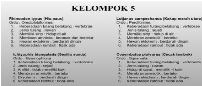
Figure 2. Result of discovery virtual media activities

In virtual media based on Discovery Learning, students conduct virtual activities in groups to identify and analyze the characteristic traits of several animals that have been presented. The results of the virtual activity were worked on google slides and presented.