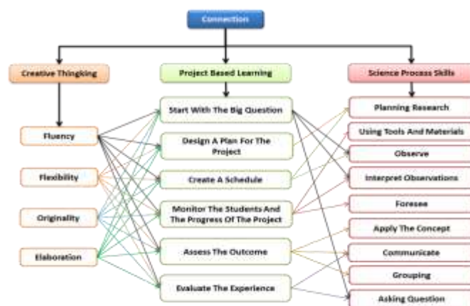
Figure 3. Relationship between PjBL model and creative thinking to science process skills

Below is a picture of the interaction net between the PjBL model and creative thinking on KPS.