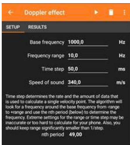
Figure 3. Phypox application view when used to collect data using the doppler effect option

students choose the doppler effect option menu and the features appear as shown in Figure 3.