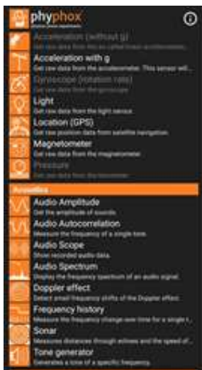
Figure 1. Initial view of the Phyphox app

students' critical thinking skills improved from an average pre-test score of 40.88 to a final post-test score of 75.73rd percentile. This study builds on previous work by combining problem-based learning models with phyphox learning assistance tools in an effort to enhance students' critical thinking abilities.