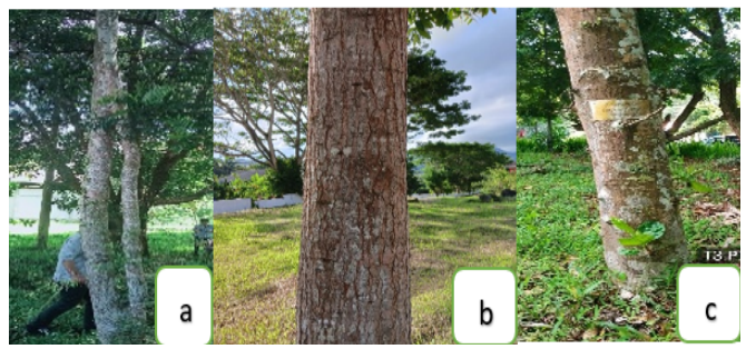
Figure 2 . Species with the Highest IVI Score: a) Petrocarpus indicus , b) Diospyros celebica , c) Atrocarpus heterophyllus .

Table 1 shows that the species with the second highest number of individuals is Atrocarpus heterophyllus with 3 individuals but Table 2 states that the species has the third highest Important Value Index (IVI) score. This is because the determination of the level of mastery of a species over other species is not only determined by the number of species but is a combination of the density, frequency, and dominance of a species (Kainde et al., 2011). In this study, this is because Diospyros celebica has a larger stem diameter than Atrocarpus heterophyllus , making the species to have a greater IVI score than Atrocarpus heterophyllus which has more individuals.