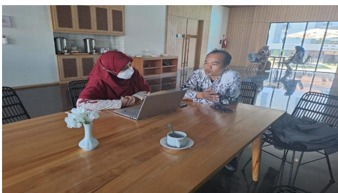
Figure 4. The process of teachers' individual interviews

The results of FGD and interviews were transcribed and analyzed inductively where the code is identified from frequent words or phrases in respondents' answers (Nyumba et al., 2018). This method aligns with the research questions that aim to interpret teachers' and