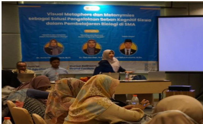
Figure 2. The presentation of metaphors in biology teaching and learning

items related to the use of metaphors, the effectiveness of using metaphors, and the interest in using metaphors in biology. The step of obtaining the data is shown in Figure 1 while the documentation of the process is presented in Figure 2, Figure 3, and Figure 4.