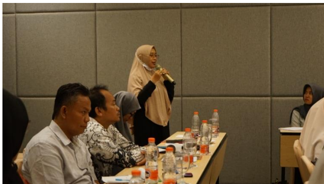
Figure 3. The process of teacher's focus group discussion (source: team research documentation)