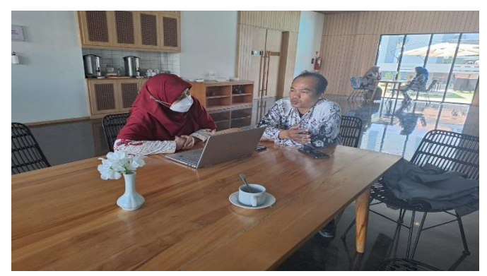
Figure 4. The process of teachers' individual interviews

The results of FGD and interviews were transcribed and analyzed inductively where the code is identified from frequent words or phrases in respondents' answers (Nyumba et al., 2018). This method aligns with the research questions that aim to interpret teachers' and