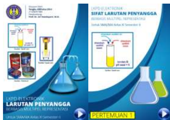
Figure 2. Partial presentation of the electronic student worksheets content

The design phase is executed through the creation of electronic student worksheets pertaining to the topic of buffer solutions. This electronic student worksheet comprises a cover, electronic student worksheets user guide, instructional guidelines, basic competencies, core competencies, learning objectives, concise content, session 1 on the properties of buffer solutions, session 2 on the pH of buffer solutions, session 3 on the role of buffer solutions, laboratory activities, questions, answer key following the questions, and a bibliography.