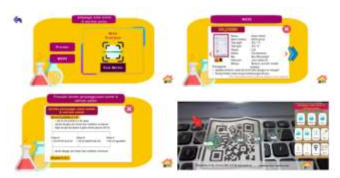
Figure 5. Start experiment menu display

Figure 4 displays the content menu, user manual, basic competencies, and compiler profiles. The material menu consists of discourses and animated videos of the working principle of a buffer solution. Learning using animation can increase students<sup>^</sup> interest in learning and help students understand the concept (Eli et al., 2018). The display of the experiment start menu is shown in Figure 5. This menu can only be opened after the user opens the material menu so the students will have the provision of information to relate the information obtained after experiment. This is in line with Ausubel's learning theory which in meaningful learning students are asked to link the knowledge that students already have with information so that it can produce a complete understanding of the material (Gazali, 2016). In this menu, there are three experiments available, namely the acetic acid buffer experiment with sodium acetate, the ammonia buffer with ammonium chloride, and the sodium chloride solution. In each experiment, information is provided regarding the Material Safety Data Sheet (MSDS) of the materials used and the experimental procedures to be carried out. On the aspects practicum page, three of multiple representations are shown. Macroscopic aspects are visualized in the form of 3D objects, submicroscopic in