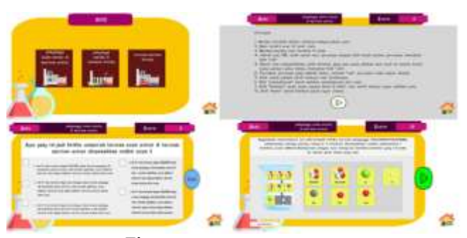
Figure 6. Quiz menu display

the form of molecular animations contained in 3D objects, and symbolic in the form of reaction equations for each reaction that is being carried out. Implementation practice should be done coherently in accordance with procedures listed to avoid the occurrence of error so that users should repeat the practicum.