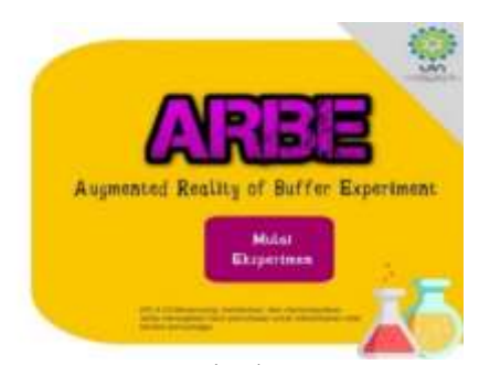
Figure 3. Main menu display

On main menu of ARBE application there are the logo of creator's university, information of basic competencies that have to achive by user, and music button to turn on and turn off the music. Music is used in the application aims to increase enthusiasm, focus, provide relaxation, have fun, stimulate experiences, provide relaxation, determine the theme of the day, and build relationship (De porter in Supradewi, 2010). On main menu there is also exit button to exit the application. ARBE application consists of six menus, general instructions the menu, competencies, materials, start experiment, quizzes, and