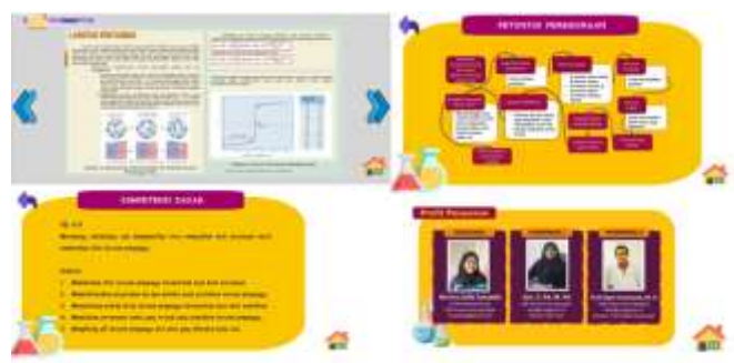
Figure 4 . Display of material menu, instructions for use, basic competencies, and compiler profile

compiler profile, as shown in Figure 3. The material menu, start experiment, and quizzes can only be opened sequentially. To run the practicum, users are required to use the markers in Figure 2 to display 3D objects.