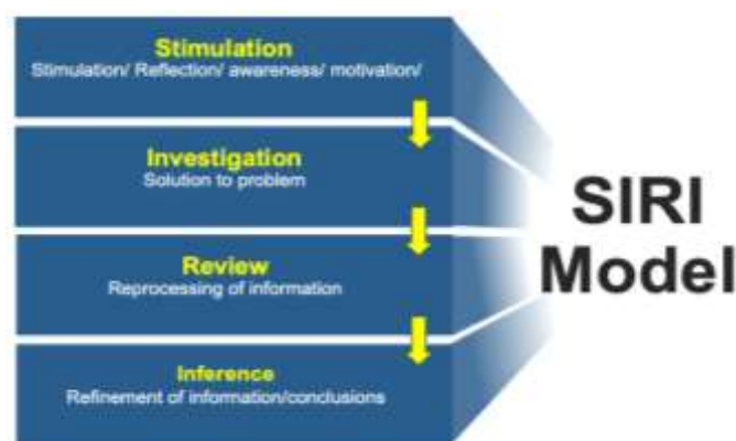
Figure 1. SIRI Model Syntax

This study used a pretest-post-test non-equivalent control group design (Cohen et al., 2011). There were three treatment groups in this study, namely the experimental group, positive control and negative control. The experimental group was taught using the SIRI learning model (Figure 1), the positive control group was taught using the PBL model and the negative control group was taught without using a special learning model (Conventional). The research design is presented in Table 1.