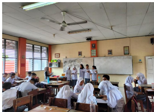
Figure 3. Student present the results of group discussions

class for experimental, the process of learning was given material for teaching containing student worksheet based on the creative problem-solving model with concept maps at each meeting. When filling out the student worksheet, students seemed confused because they had never been given a student worksheet based on the creative problem-solving model. So that it causes many students to ask questions, this makes researchers feel overwhelmed in dealing with the situation. However, this can be overcome by providing further instructions or explanations on how to fill in the student worksheet contained in the material for teaching, then the researcher gives time for them to discuss with their respective group friends. If there are still questions, the researcher will direct each group and help so that slowly students can understand it well. The student worksheet contained in the teaching material helps students to find a new concept to solve a problem. Where in the student worksheet there are stages that help students to solve a problem so that it can improve outcomes of learning from students (Nurulwati, 2020).