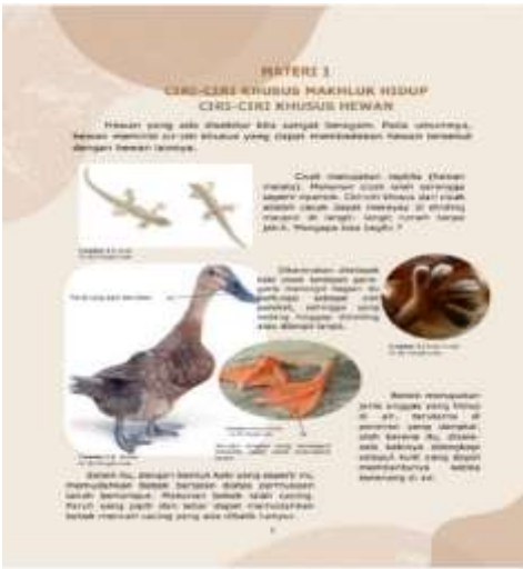
Figure 4. The background appearance of the revised encyclopedia

Validation of media in terms of the development of instructional media and teaching materials. Some feedbacks were provided regarding multimedia, namely: the need to improve color and contrast, the use of attractive fonts, adding images of living creatures on the front cover, and adding backgrounds to each page of the encyclopedia.