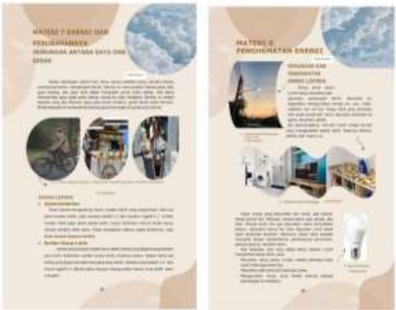
Figure 3. Encyclopedia material revision

From the material expert validation results, suggestions were obtained in the form of the material still needed revision. It was then improved and refined in accordance with the suggested improvements.