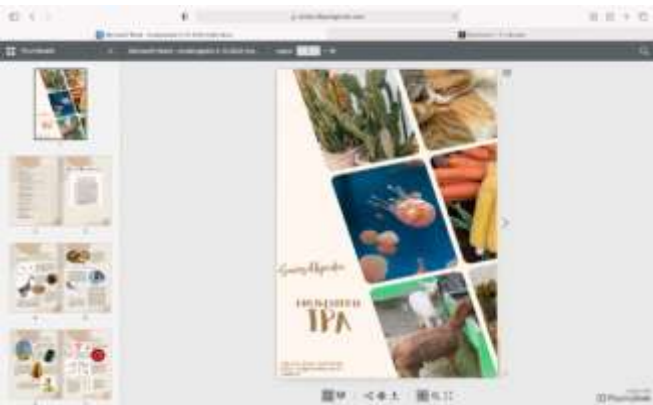
Figure 2. Digital encyclopedia-based product design

In the stage of developing the digital encyclopedia product, it is validated by experts, including subject matter experts, media experts, and language experts. The product development begins with designing the digital encyclopedia using the PowerPoint application. Once the design draft is completed, the researchers then creates digital encyclopedia links using the WPS Office application that can be accessed by every student through their smartphones.