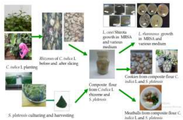
Figure 2. Product of research process

To make cookies and meatball formulation which are healthy and acceptable by market was going through various tests. The acceptable formulation is using C. indica L flour 80 gr, C. indica L starch 20 gr, coconut oil 60 gr, coconut sugar 50 gr, milk skim powder 40 gr, egg 40 gr and S. platensis powder 1 g. Cookies product result is fibrous, soft, and crunchy. Also has density to ensure it do not crumble easily. Taste close to sweet and has smell of coconut aroma to satisfy consumers. The following is presented a figure describing the product of the research process (Figure 2).