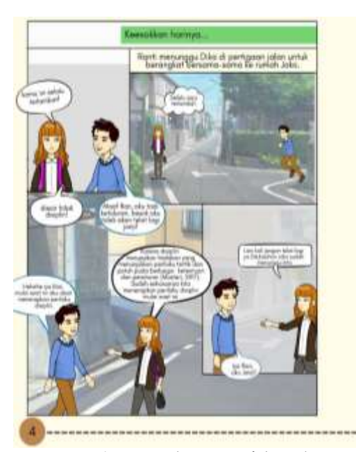
Figure 5. Character of discipline

The character of cooperation is also seen from student group members who work together in working on student worksheet. Thus, because they are accustomed to being involved or carried out in the learning process, these characters have been embedded in students, so the percentage of these three characters is high. Meanwhile, for the character of curiosity, the teacher during the learning process instructs students if they want to ask questions related to the material of the first and second meetings and at the stage of analyzing and evaluating, the teacher again invites students to ask about material that has not been understood in order to foster students curiosity and dare to ask. However, it was seen that not all students asked, namely 5 to 6 people who asked every meeting. This can happen because each student has a different curiosity, there are times when students have questions but are afraid to express their questions.