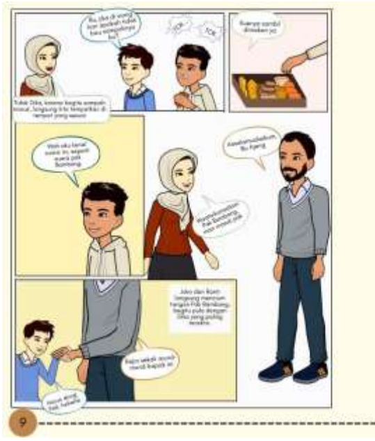
Figure 4. Religious character

The cultivation of character education in this research was achieved through invitations and examples of good character modeling inserted in character-based comics, including religious, disciplined, curious, environmentally conscious and cooperative characters. However, when compared with 3 characters such as religiousness, discipline, and cooperation which get percentages above 70%, the characters of curiosity and caring for the environment only get percentages of 72.22% and 71.39% even though they are classified in the good category. This can happen because the activities of the three characters are used to being involved or carried out in the learning process.