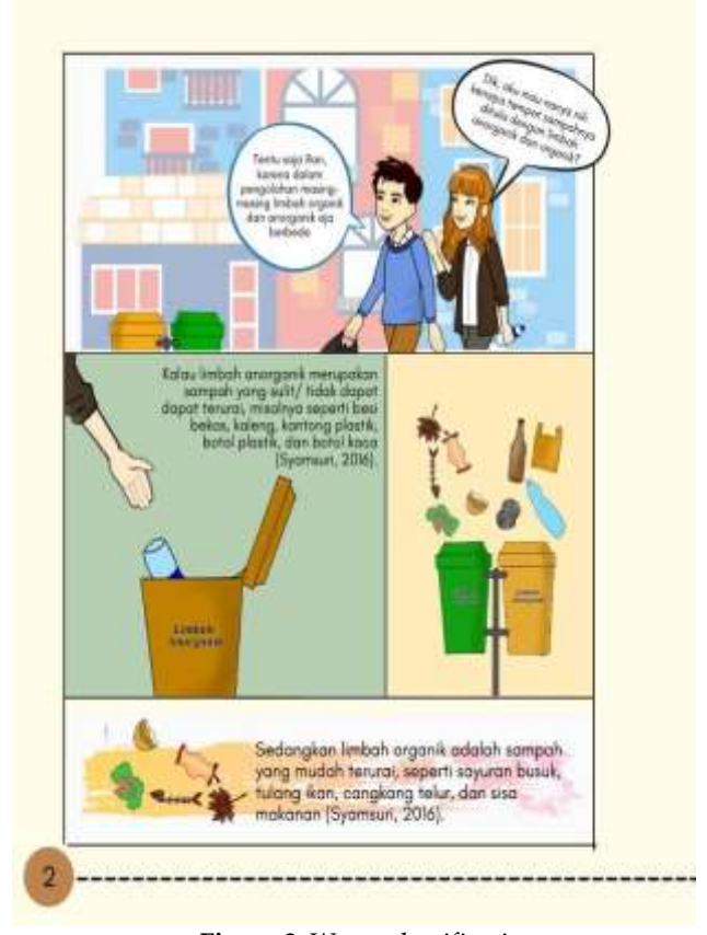
Figure 3. Waste classification

Meanwhile, students in the control class only presented points and when working on student worksheet outside of class, students only relied on material that had been presented by the teacher using Powerpoint . Thus, the use of character-based comic media can make it easier for students to study anywhere. This is supported by Utariyanti et al. (2015) that the benefits of comics in printed form are so that students can easily use them at any time without the help of electronic devices.