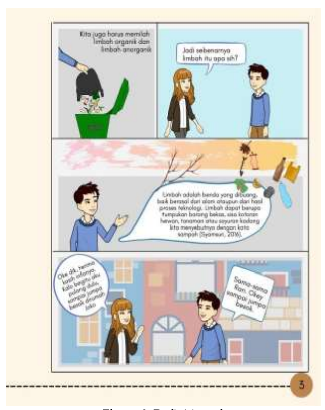
Figure 2. Definition of waste