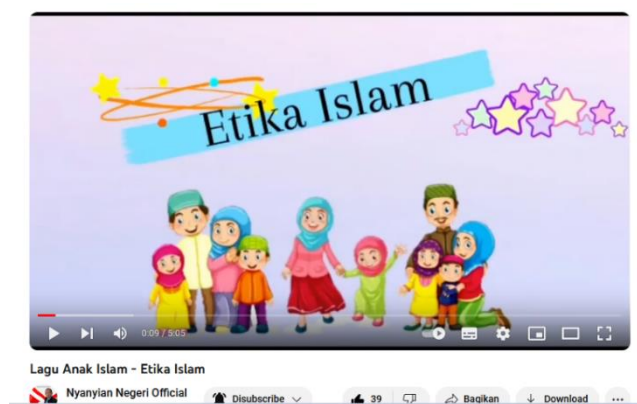
Figure 2. YouTube channel

children, especially elementary school children. The current phenomenon is that children in elementary school are more interested in songs that adults should listen to, but currently elementary school children are more likely to like adult songs. The lack of interest in children's songs is one of the reasons why artists rarely create songs with children's themes. Choosing a learning method by taking one of the children's songs is expected to allow students to listen to music appropriate to their age. The learning innovation applied to fifth grade students at Muhammadiyah Elementary School PK Rabbani Karanganyar K Karanganyar was by taking one of the songs on the Official Nyanyian Negeri Youtube channel.