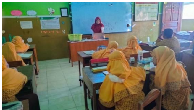
Figure 3. Song Playback

characteristics of class V participants still like learning that utilizes learning media and are more enthusiastic when the teacher uses songs in the process of delivering material.