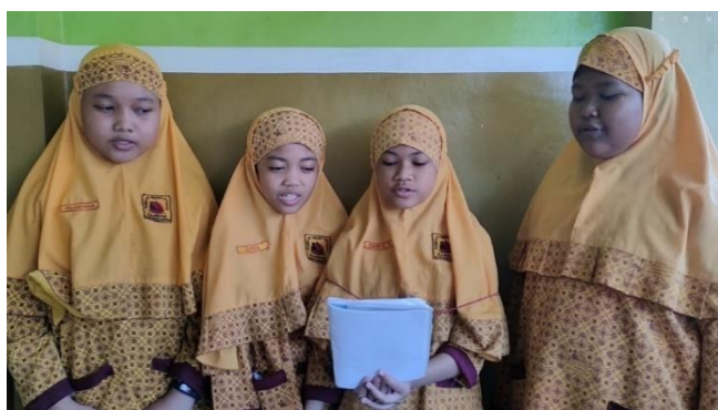
Figure 5. Reading Poetry.