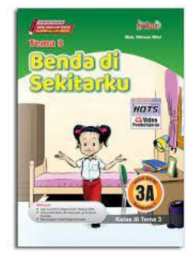
Figure 1. Example of teaching materials based on the Kvisoft flipbook maker application

Using the Kvisoft flipbook creator tool, researchers created instructional materials during the development phase that used a problem-based learning model that was created during the design phase. Next, schedule a meeting with specialists to evaluate the appropriateness of the created instructional resources. Once the instructional materials have been developed, they are reviewed and approved by an experienced team, who also provide comments and suggestions for revision. This instructional material is deemed valid based on evaluation of the final result through exams and completed changes. The following table provides an overview of the findings from product validation tests conducted on instructional materials utilizing the PBL approach in class III primary schools and based on the Kvisoft flipbook creator application: