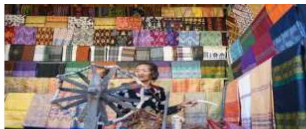
Figure 2. The stage of pintal benang (processing cotton into thread)