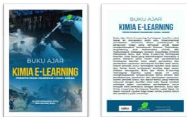
Figure 1. The e-learning chemistry book integrated with Sasak local wisdom cover

https://modul.buanatechno.id/kampus/kimia/1/mobile/index.html . The examples of images and videos in the e-learning chemistry book integrated with Sasak's local wisdom can be seen in Figures 2 and 3.