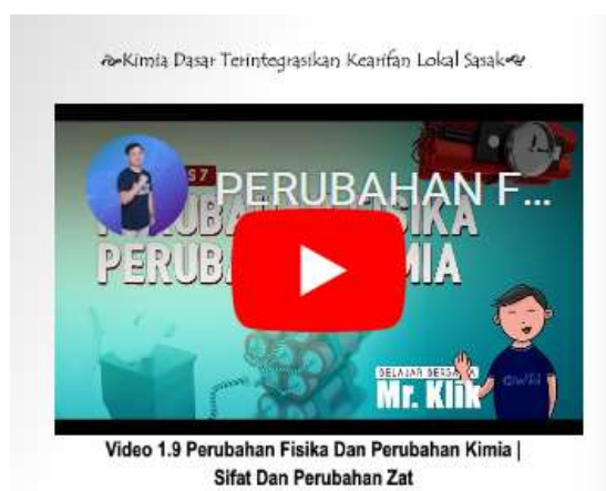
Figure 3. Video of physical and chemical changes

Before validating the product, it underwent a preliminary check by a team of two proofreaders, including a chemistry content expert and a Sasak culture expert. Input and suggestions from the proofreading