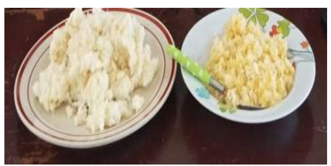
Figure 1. Uwi kaju ndota

Steaming, steaming is the final stage in making uwikajundota. At this stage, the steamer pan is lined with banana leaves to prevent the uwikajundota from sticking or sticking to the steamer and giving a distinctive aroma to the food. Apart from that, because banana leaves have a layer of wax on both surfaces of the leaves, they are waterproof. During the steaming process, the water vapor that rises to the top is held back by the wax layer so that only the heat is distributed to the food, resulting in the steamed food not being watery and cooked evenly.