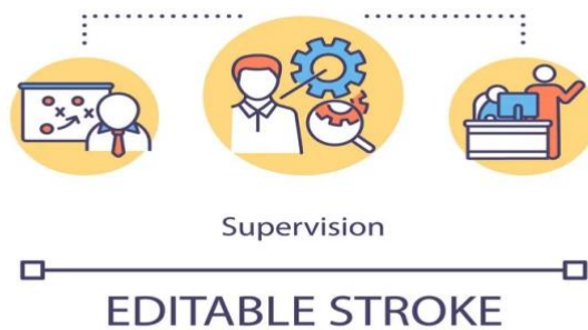
Figure 1. Supervision Concept Icon Vector

Modern technologies represented in the internet, computers, smart devices (Dankan Gowda et al., 2020; Khan et al., 2020), and other technological means are one of the most successful media that provide an integrated and attractive educational environment at the same time (Goldin et al., 2022). Furthermore, they enable to connect people of all ages and businesses at anytime and anywhere with minimal effort, time and cost. Relying on these modern technologies makes a remarkable development in the school environment by working to promote them in all its components and elements to achieve its goals and objectives (Selem, 2021).