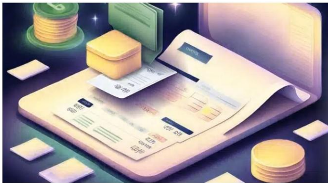
Figure 1. Illustration of Electronic Invoice

These adverse effects can be avoided by using an online tax invoice application. The online tax invoice application has been based on the latest law, namely PER-03 / PJ / 2022. The main difference between paper tax invoices and e-invoices is the ease, convenience, and security obtained by PKP in fulfilling its tax obligations. Other advantages of e-invoicing are that the format has been determined by the Directorate General of Taxes (DGT); can use electronic signatures; not required to print paper; PKP has been specifically determined by the DGT; reporting directly to the DGT and getting DGT approval.