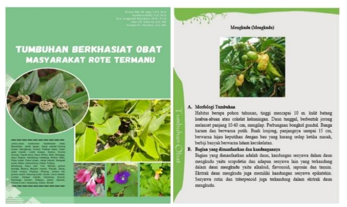
Figure 1. (a) Front cover of the book, (b) book content

questionnaires and suggestion columns provided to each expert.